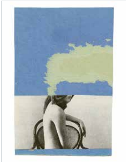
Print, numbered and signed by the artist